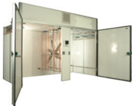
Figure 1 : Example of single-stage setter (Chickmaster)

A large majority of hatchery operators use multiple-loading machines; therefore, most often, incubators are loaded by thirds every week (by setter tray or trolley), which makes it possible to have both eggs requiring heat and others releasing heat in the same environment.