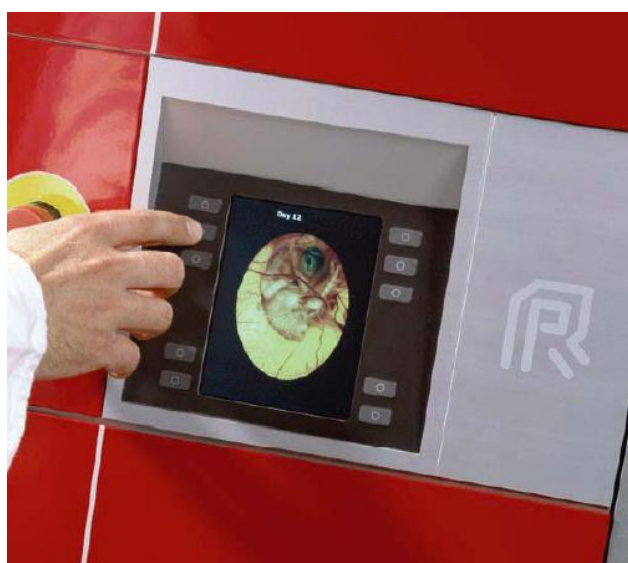
Figure 3 : Example of full-monitoring system (PAS REFORM)

The temperature settings will be higher at the beginning of the incubation process and progressively declining from mid-incubation onward, with the objective of constantly maintaining egg shell temperature close to 37.8°C.