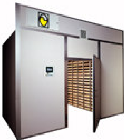
Figure 2 : Example of multi-stage setter (Petersime)

However, the great diversification of breeds and constant research to optimize their performance have led to define optimal incubation parameters for each type of breed according to the needs of embryos at each stage of embryonic development.