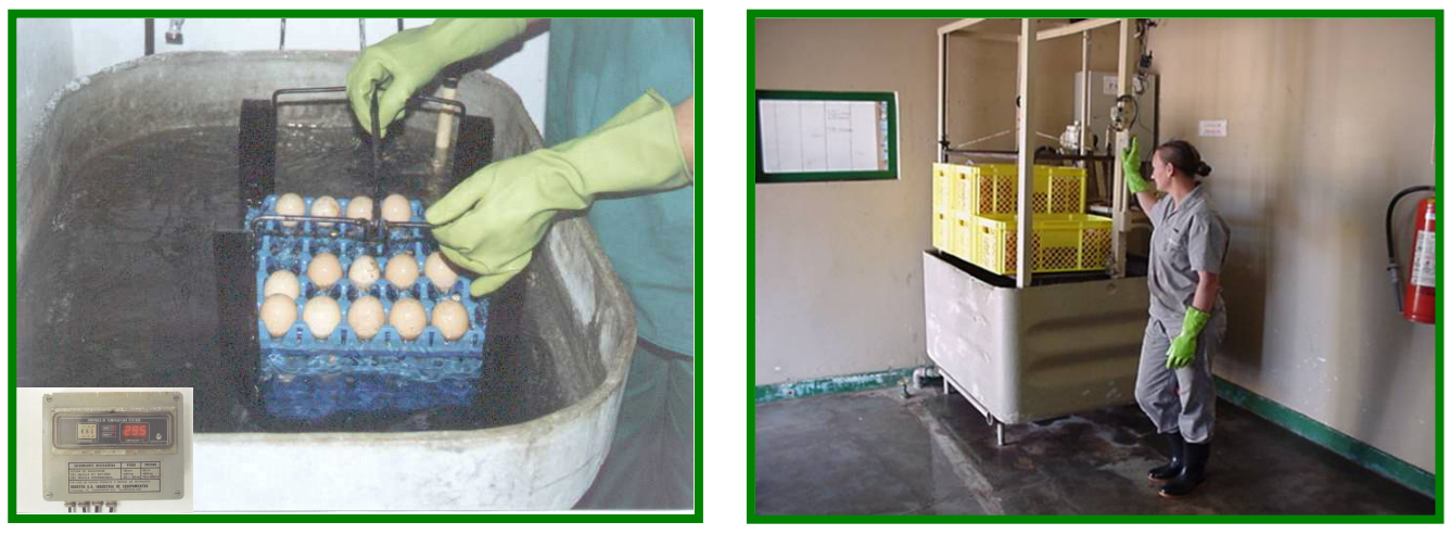
Figure 2 & 3 : Illustration of manual dipping with dirty eggs remaining

This method must be carried out very carefully. The temperature, for the reasons seen before, has to be monitored strictly to avoid any risk of temperature shock. Especially after dipping dirty eggs, the dirtiness remains in disinfectant solution and it can induce: