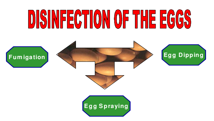
Figure 1 : Three major ways of egg-disinfection in the farms