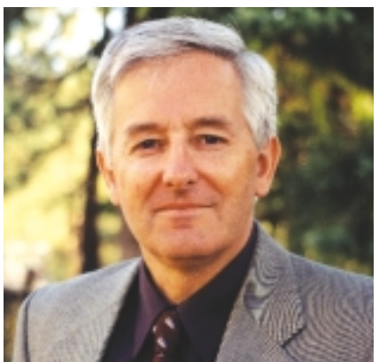
Chapman: 'I recommend that producers use an effective chemical drug to help clean up any Eimeria still present in the house.'

"Summertime, and the livin' is easy." So goes the song from a Broadway musical. Coincidentally, that line sums up perfectly the seasonal significance of a major poultry protozoan disease.